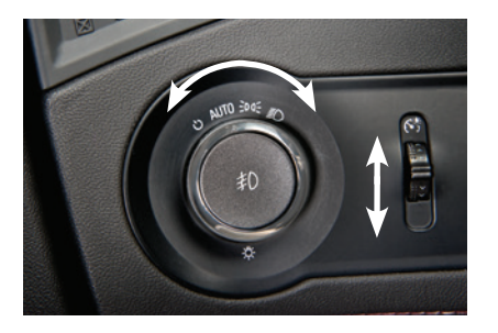
Instrument Panel Lighting

Rotate the knob to activate the exterior lights.