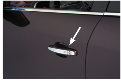
2015 model shown