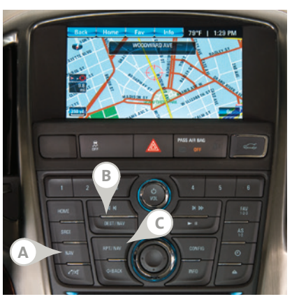
Note: When the vehicle is moving, various onscreen functions are disabled to reduce driver distraction.